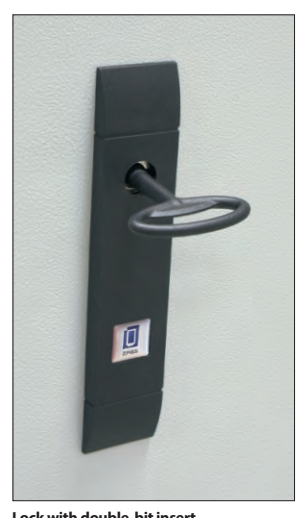
Lock with double-bit insert (factory installed)