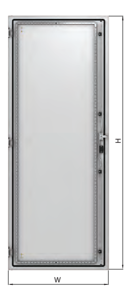
Package: 1 pc.